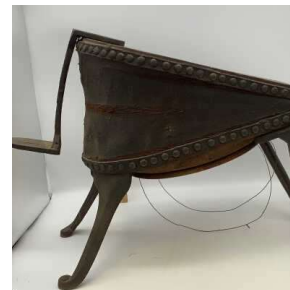
This is a foot-operated dental bellows. The bellows were used to power flames in soldering metal to make bridge work and crowns.

This collection of cherry-pitters ranges from single to double and plunge action to cranked.