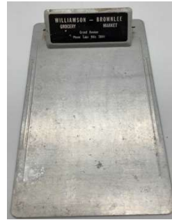
Small clipboard from Williamson-Brownlee Grocery & Market Grand Avenue Phone Lake Villa 3841

We will be featuring many of these items in displays at the museum and in future issues of Vintage Views. Here is a sample to get started.