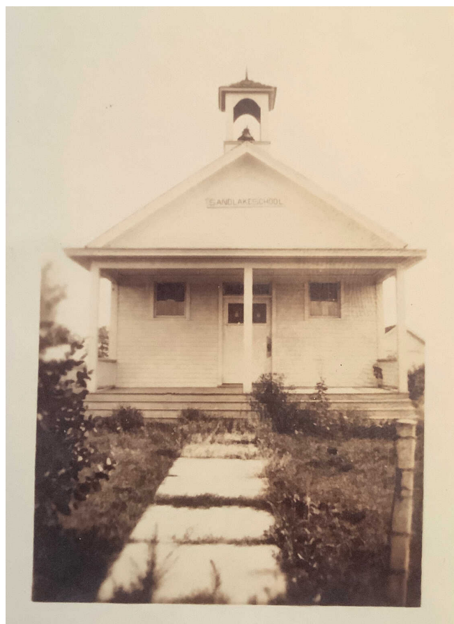
Photo of Sand Lake one room school house.

Sand Lake School served many local residents including the Douglas, Lucas, Reidel, Kidera, Kallal and Weber families until March 14, 1947, when it was annexed into Lake Villa School District 41. By 1952, the schoolhouse was sold to private owners. The original cast iron school bell was donated to Lake Villa Historical Society and is displayed at Peacock Camp.