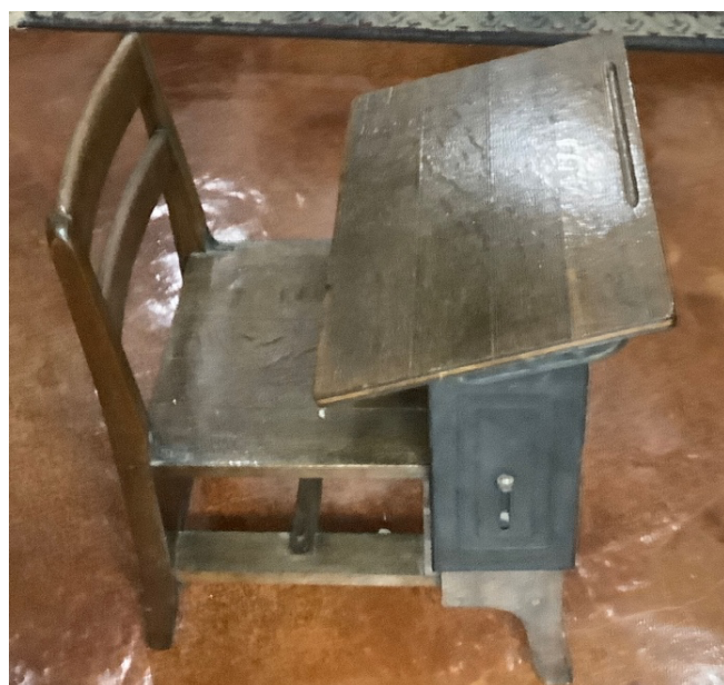
Photo of Sand Lake School desk on display at Lake Villa Historical Society museum