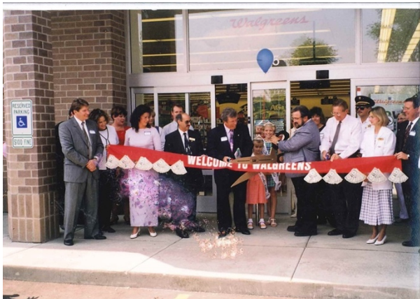
Walgreens Ribbon Cutting