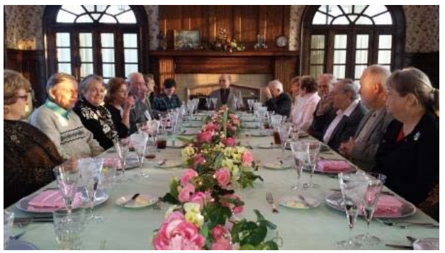
Raffle Dinner at the Mansion 2014