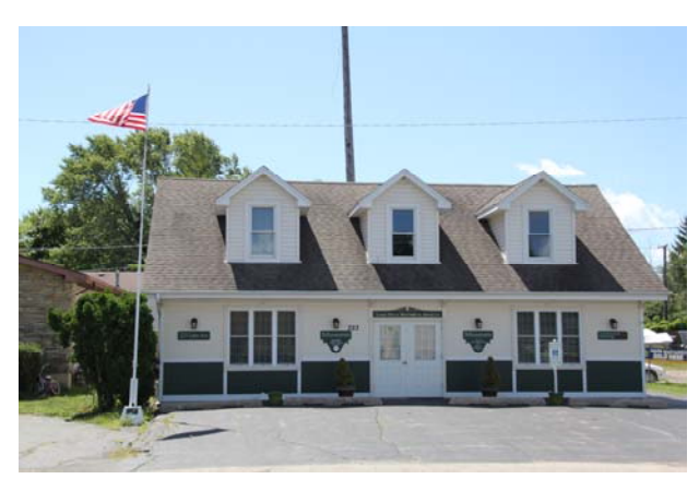
LVHS new home after remodeling