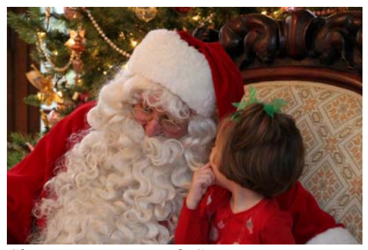
Sharing secrets with Santa