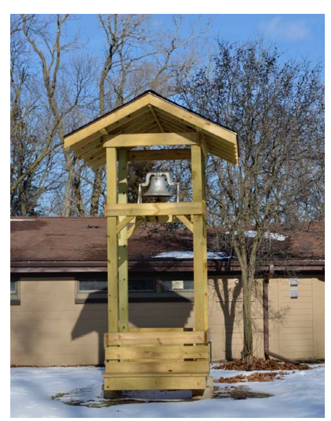
Sand Lake School Bell displayed at Peacock Camp