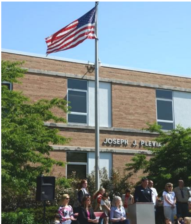
Photo of the closing ceremony of Joseph J. Pleviak School

Members attended the closing ceremonies at Pleviak School in June and accepted the time capsule representing this historical landmark built in 1910. In September we had a display at the Lake Villa District Library of "Old Time Schools in Lake Villa" in recognition of the closing of the many one room school houses and the iconic school building where Lake Villa students were educated from 1910-2014.