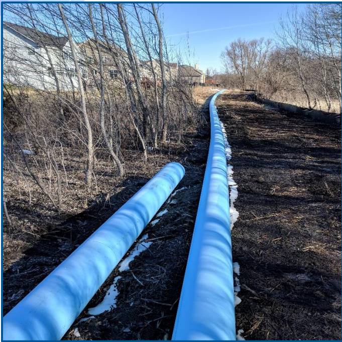
Figure 1: New drinking water pipeline prior to installation that now delivers water to Lake Villa and Fox Lake Hills residents.

CLCJAWA utilizes over 50 miles of pre-stressed concrete, ductile iron and PVC water main to deliver water to your community. Your public works department, in turn, maintains its own water distribution system that delivers the water to homes, schools and businesses in the community.