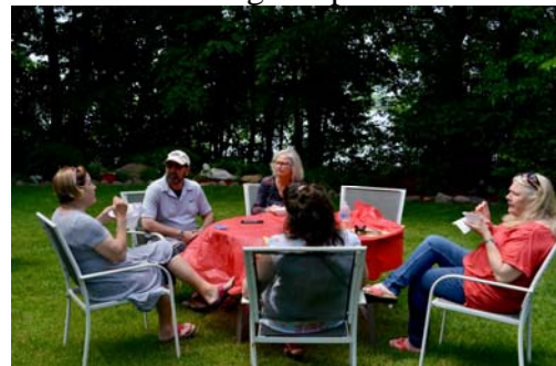
Guests relaxing on the grounds of Tir Na Nog following a tour of the house and grounds.