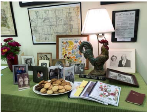
Objects used to tell the stories of wonderful women in our lives.