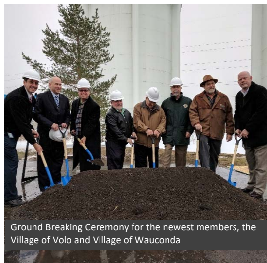
Ground Breaking Ceremony for the newest members, the Village of Volo and Village of Wauconda

CLCJAWA received the Excellence in Water Treatment award for the last 14 years. CLCJAWA was the third facility in the nation to achieve this distinction presented by the Partnership for Safe Water. This voluntary water quality program, sponsored in part by the United States Environmental Protection Agency, holds its awardees to higher standards than required by current Federal and State drinking water regulations.