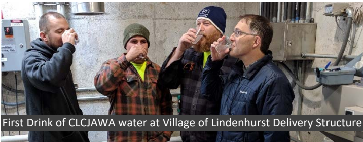
First Drink of CLCJAWA water at Village of Lindenhurst Delivery Structure

To ensure tap water safety, the U.S. Environmental Protection Agency (USEPA) prescribes limits on the amount of certain contaminants in our drinking water. Water quality may be judged by comparing our water to USEPA benchmarks for water quality. One such benchmark is the Maximum Contaminant Level Goal (MCLG). The MCLG is the level of a contaminant in drinking water below which there is no known or expected risk to health. This goal allows for a margin of safety. Another benchmark is the Maximum Contaminant Level (MCL). An MCL is the highest level of a contaminant that is allowed in drinking water. An MCL is set as close to an MCLG as feasible using the best available treatment technology.