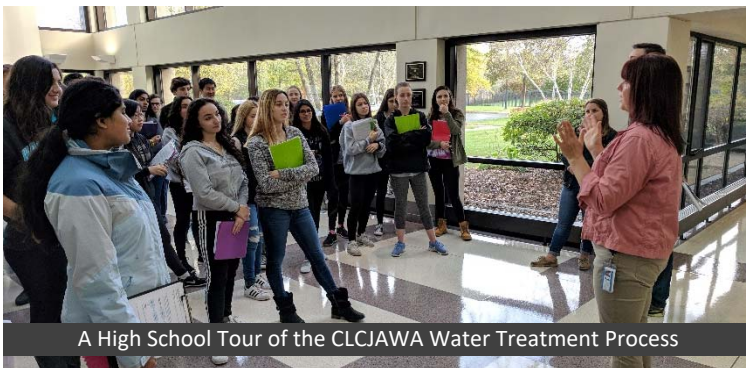
A High School Tour of the CLCJAWA Water Treatment Process

The Village Board has a monthly meeting schedule, and the public is always welcome to attend any of these meetings. Our Mayor is also a member of the Board of Directors of CLCJAWA, which meets regularly. Please visit the website at www.clcjawa.com for the current meeting schedule. CLCJAWA provides tours of the water treatment facility, and staff members are also available for public speaking or for school visits. Please contact the Village or CLCJAWA for more information.