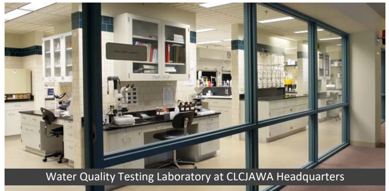
Water Quality Testing Laboratory at CLCJAWA Headquarters

Our tap water quality is consistently monitored by the Village, by the Illinois Environmental Protection Agency (IEPA), in the CLCJAWA Water Quality Lab, and by other independent labs. This aggressive water quality assurance program is thorough: bacteriological tests are conducted six times more often than required, water clarity is monitored every 10 seconds, and our water is checked for over three hundred contaminants annually.